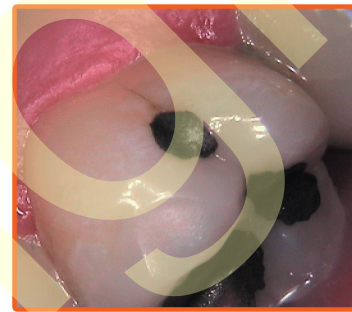
Exceptional digital images. A significant aid to diagnosis.