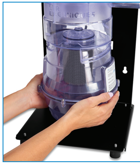
Step 1: Twist used Container off