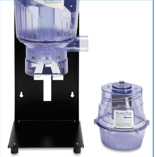
Step 3: Twist new Container on.