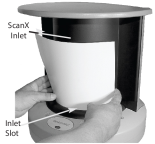
Figure 2. Aligning the ScanX Cleaning Sheet with the Tacky Side Facing the Inlet