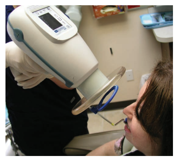
Figure 4—The plate is exposed using the NOMAD Pro 2 (Aribex).