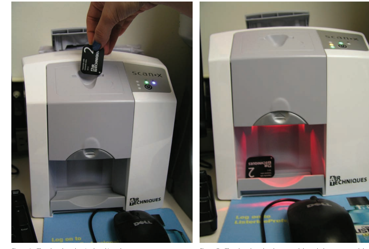
Figure 6—The phosphor plate is placed into the scanner.