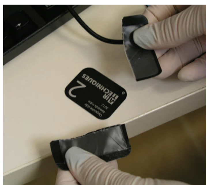
Figure 5—The barrier is opened before insertion to the Scan-X Swift (Air Techniques).