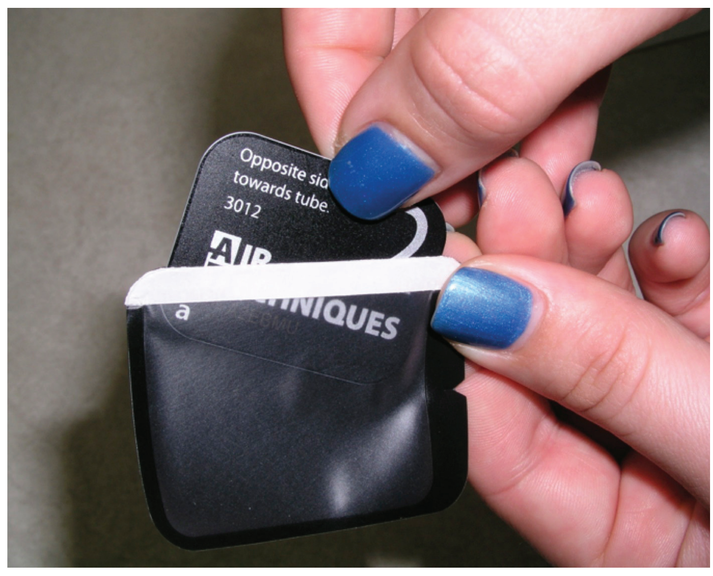
Figure 1—The ScanX phosphor plate (Air Techniques) is placed in barrier sleeve.