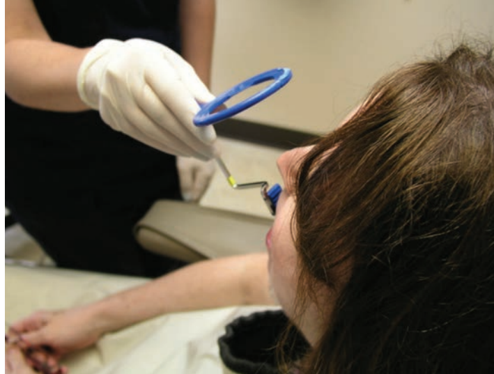
Figure 3—The patient has the protective apron (DUX Dental) placed and the XCP holder and plate is placed into the mouth.