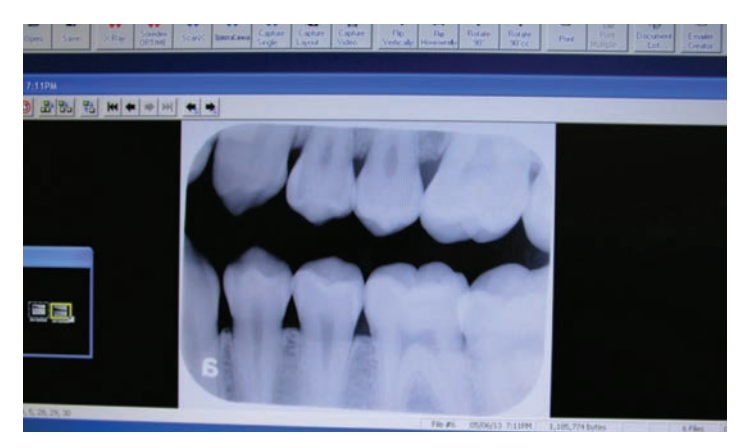
Figure 8—The radiograph is displayed in imaging software.