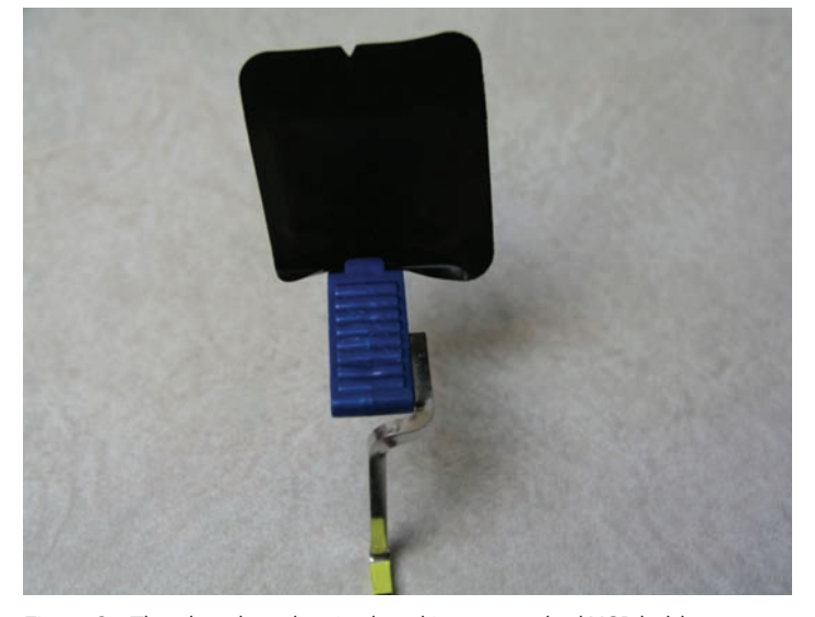
Figure 2—The phosphor plate is placed into a standard XCP holder (DENTSPLY Rinn).