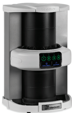
ScanX Classic, Part No. F3700 ScanX Ortho, Part No. F3750

Product Make sure to register your new ScanX online per the information Registration: provided on the User Information Folder.