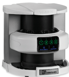
ScanX Intraoral Part No. F3600