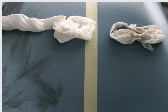
Remove excessive cleaning solution with a dry towelette. Remaining, unbound grime will be removed.