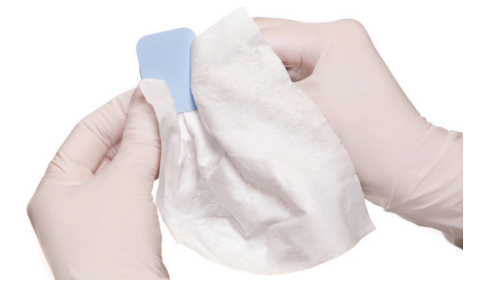
PSP Cleaning Wipes PN B8910, Box of 50