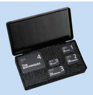
Plate Transfer Box PN 73470, Qty. 1