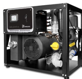
MOJAVE LT Dry Vacuum System from Air Techniques

Just like coffee machine companies also sell their own descaling solutions, Air Techniques, a company that manufactures dental vacuums, began selling CleanStream in 2005 and branded it under the Monarch name in 2013. The EPA's ruling a few years later further validated Air Techniques' safe, effective evacuation system cleaner that's