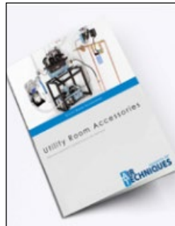
UTILITY ROOM ACCESSORIES