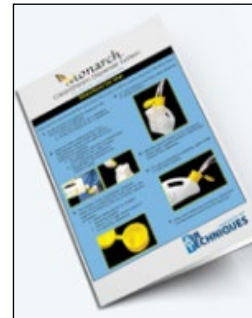
MONARCH CLEANSTREAM DISPENSER SYSTEM - OPERATORS MANUAL