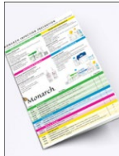
MONARCH KEY FEATURES TEAR PAD