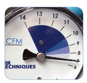
Operatory 2 Before: 7 After: 10

Before: 6.5 After: 9.5 Prior product used: PureVac SC Dispensing system of prior product: Bucket Protocol of prior product used: Multiple times per day