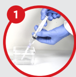
1 Collect and filter sample

"The kit provides a streamlined and convenient testing method that is both time- and cost-efficient," he shared. "It won't take too much time away from patient care and eliminates the need to send samples to a lab for testing."