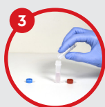
3 Add sample to test vial