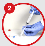
2 Wash sample with saline